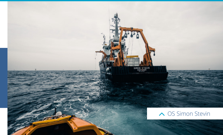
OS Simon Stevin